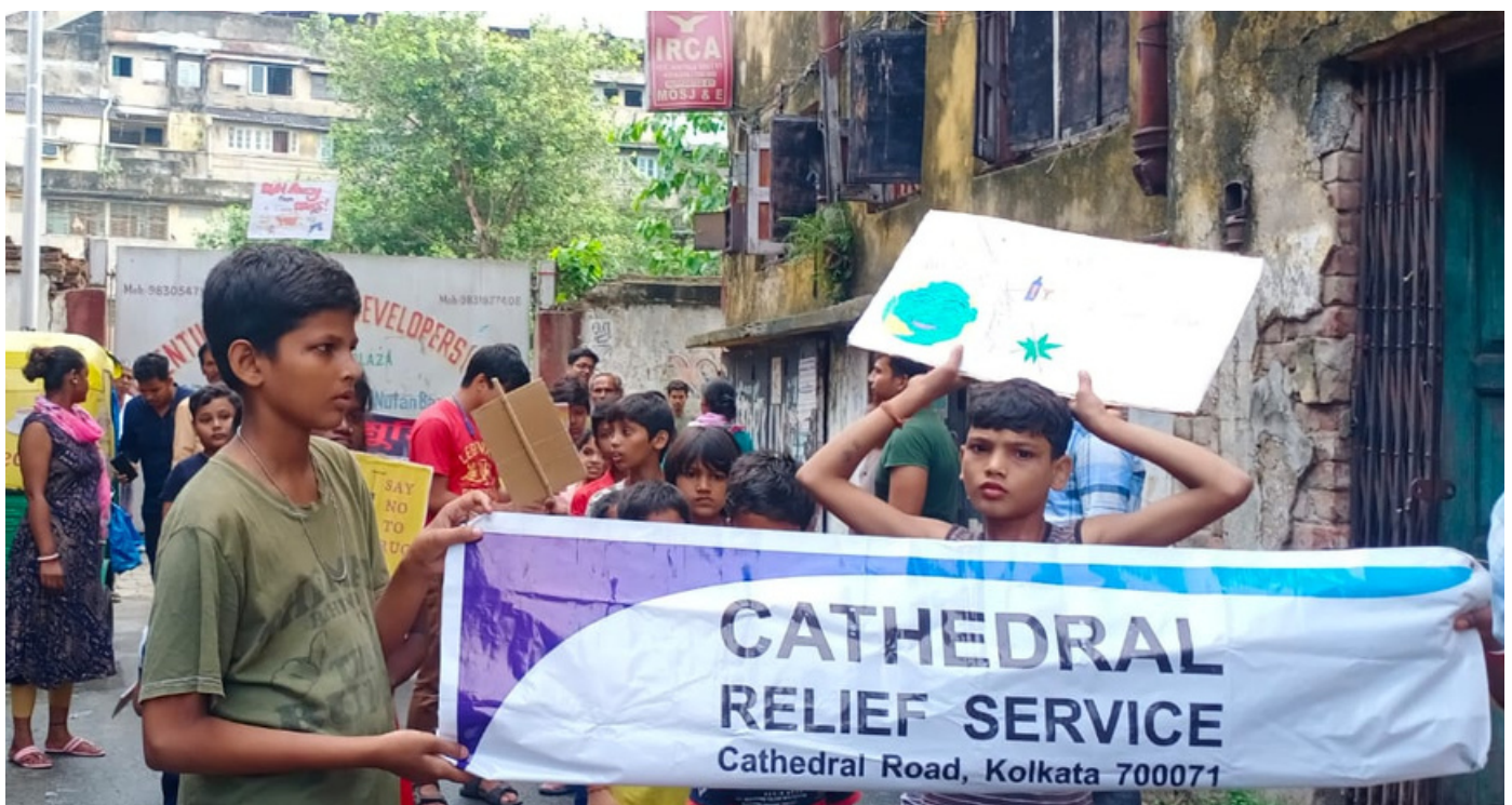
Above: The children were enthusiastic about the march, carrying banners and placards to show their support.

a compassionate approach to drug policies. With poverty widespread across Kolkata, substance abuse and trafficking are a significant issue. It is extremely encouraging to see CRS students developing an understanding of these issues, and a passion to take action and drive change.