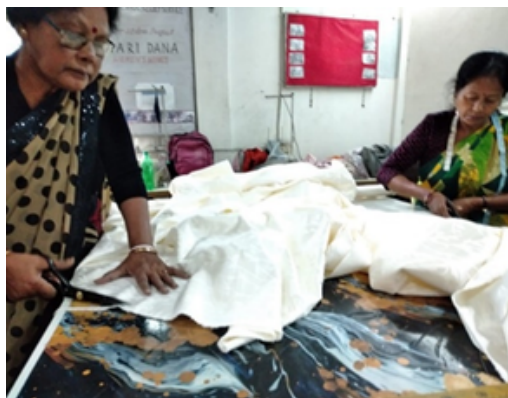
Cutting out the Stoles

At the Nari Dana production unit, the gentle hum of sewing machines carries more than the sound of work — it carries stories of resilience, dignity, and new beginnings. A dedicated group of women from the community are currently engaged in preparing clerical items for orders received from the Calcutta Diocese (Church of North India), turning skill into sustainable livelihood.