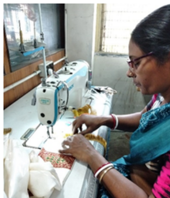
Sewing the Stoles